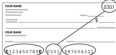
Routing number Check number Account number